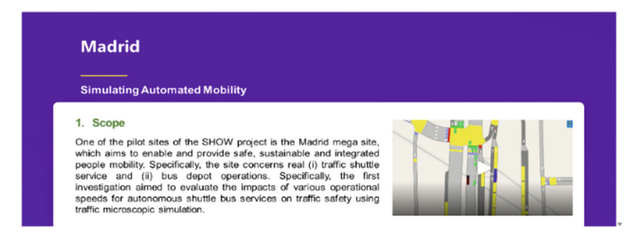
Fig. 2 Madrid pilot site: scope.